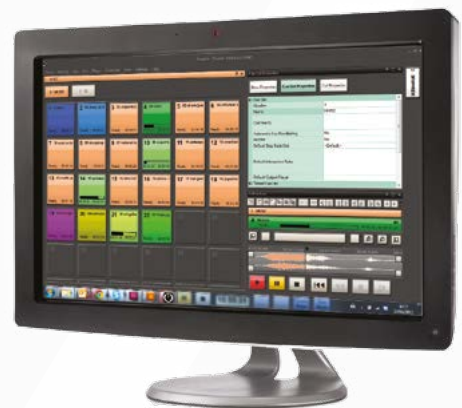
22" touch screen LCD monitor, suitable for all applications