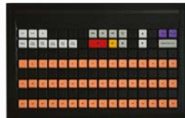
Hot keys OV keyboard Broadcast applications