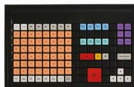
Standard OV keyboard Theatre/live applications